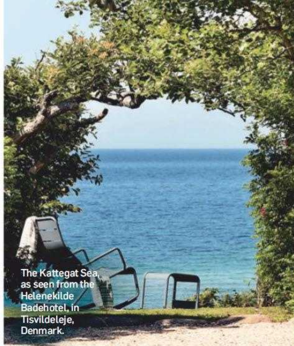
The Kattegat Sea, as seen from the Helenekilde Badehotel, in Tisvildeleje, Denmark.

Often called the Land of Gods, India's northern state of Uttarakhand is dotted with ancient temples, hill stations, and snowcapped peaks. It's home to some of Hinduism's holiest cities, one of which, Rishikesh, is considered the yoga capital of the world. And now, in addition to no-fuss accommodations catering to die-hard yogis, there are new upmarket lodgings, including the Taj Rishikesh Resort & Spa, Uttarakhand ( tajhotels.com ; doubles from $261) and the Roseate Ganges Rishikesh ( roseatehotels.com ; doubles from $413), both ultra-luxe, nature-filled retreats along the Ganges. Near the Tibetan border, the 10-suite Kumaon ( thekumaon.com ; doubles from $180) blends tropical modernism with stark Himalayan contours. Book a trek with Village Ways ( villageways.com ; from $1,707 for 11 nights) and you can meander through terraced valleys and pristine wilderness, bed down in village guesthouses, or camp on a bugyal , an alpine meadow. —R.S.